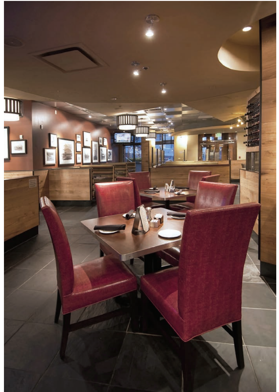
Banquette Seating + Bar Tables; Cafe Tables