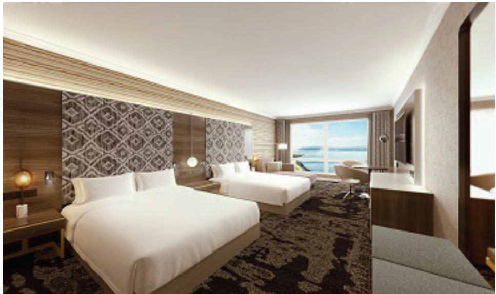
Cabinetry + Wet Bar with Integrated Sink; Bed Frames + Nightstands