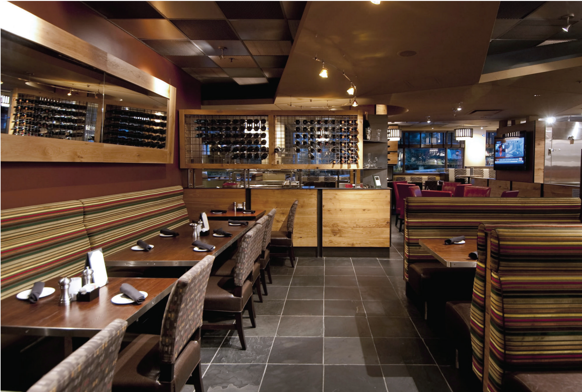
Booth Banquette Seating, Side Chairs + Cafe Tables