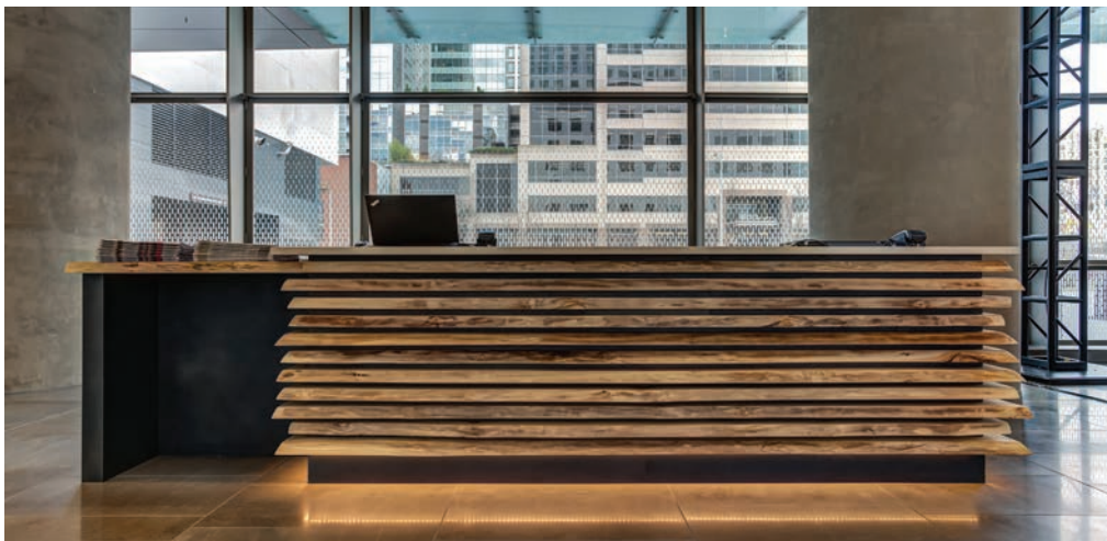
Concierge & Reception Desks crafted with Live Edge Maple and Metal with Lighting + Solid Surface Tops