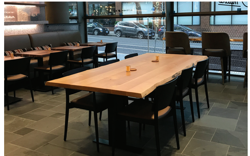
Bar Height Solid Wood Round Tables on Steel Base; Planked Ash Tables; Planked Live Edge Maple Table