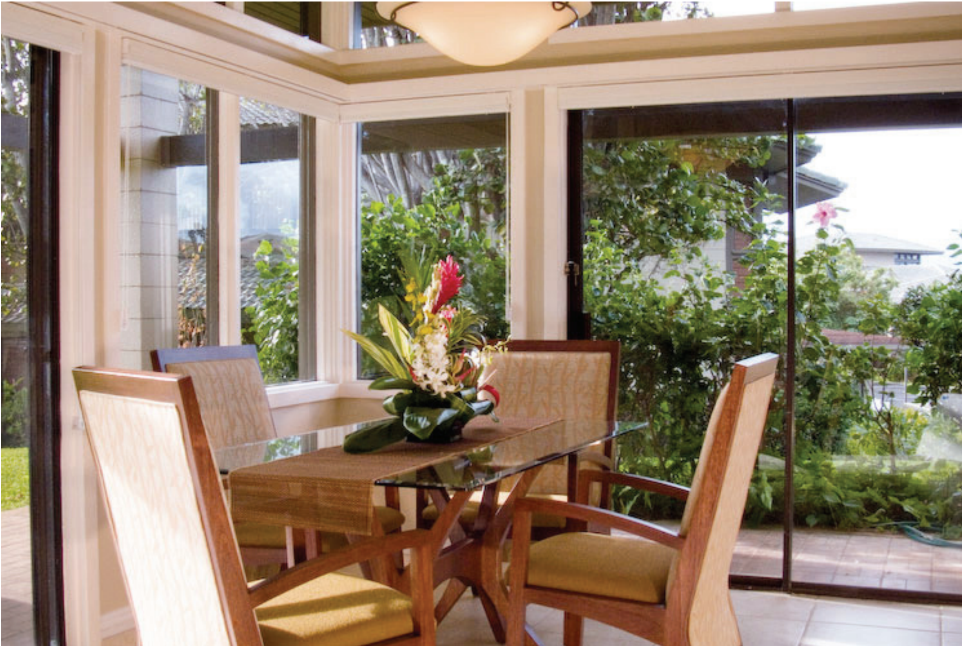
Dining Table + Chairs