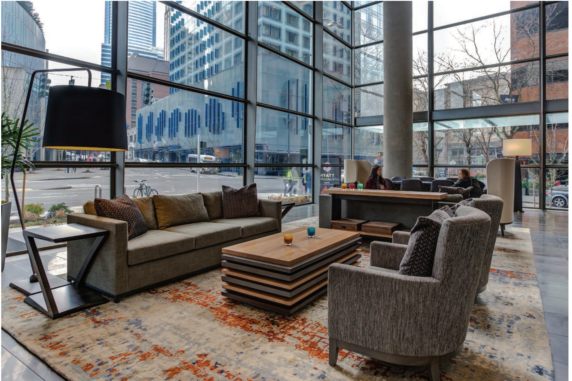
Solid Wood Side Tables + Coffee Tables