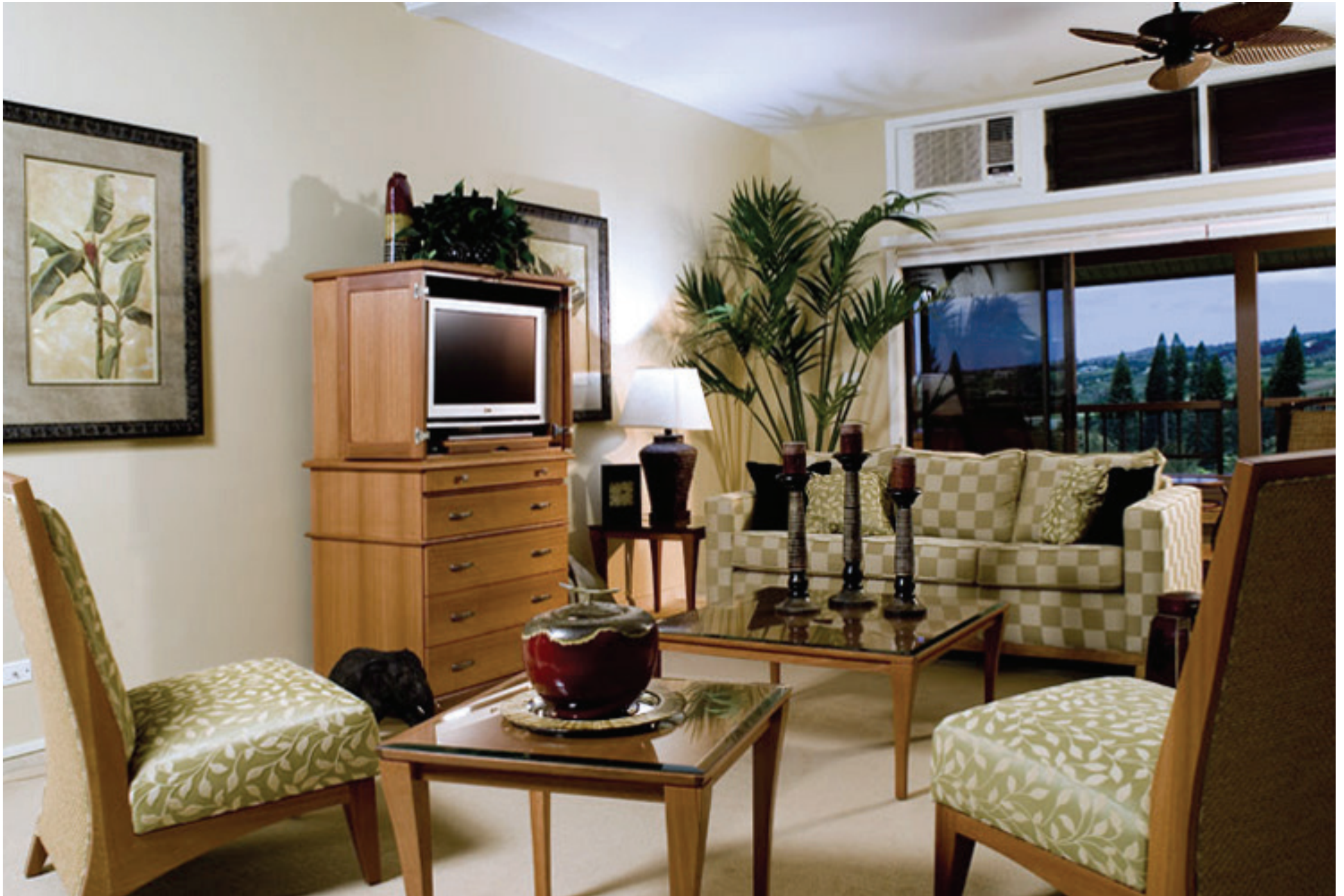
TV Cabinet with Drawers, Side + Coffee Tables; Lounge Chairs + Sofa