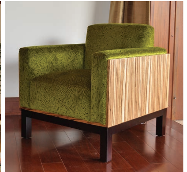
Dining Table + Chairs; Bed Frame, Nightstand + Settee; Custom Belltown Lounge Chair; Armoire with Drawers