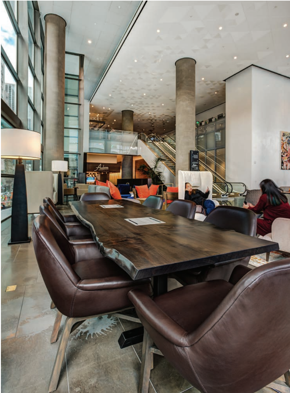
Solid Wood Live Edge Community Tables with Integrated Data Units