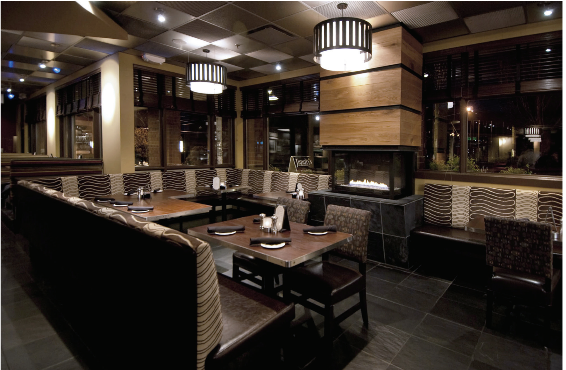
Booth Banquette Seating, Side Chairs + Cafe Tables